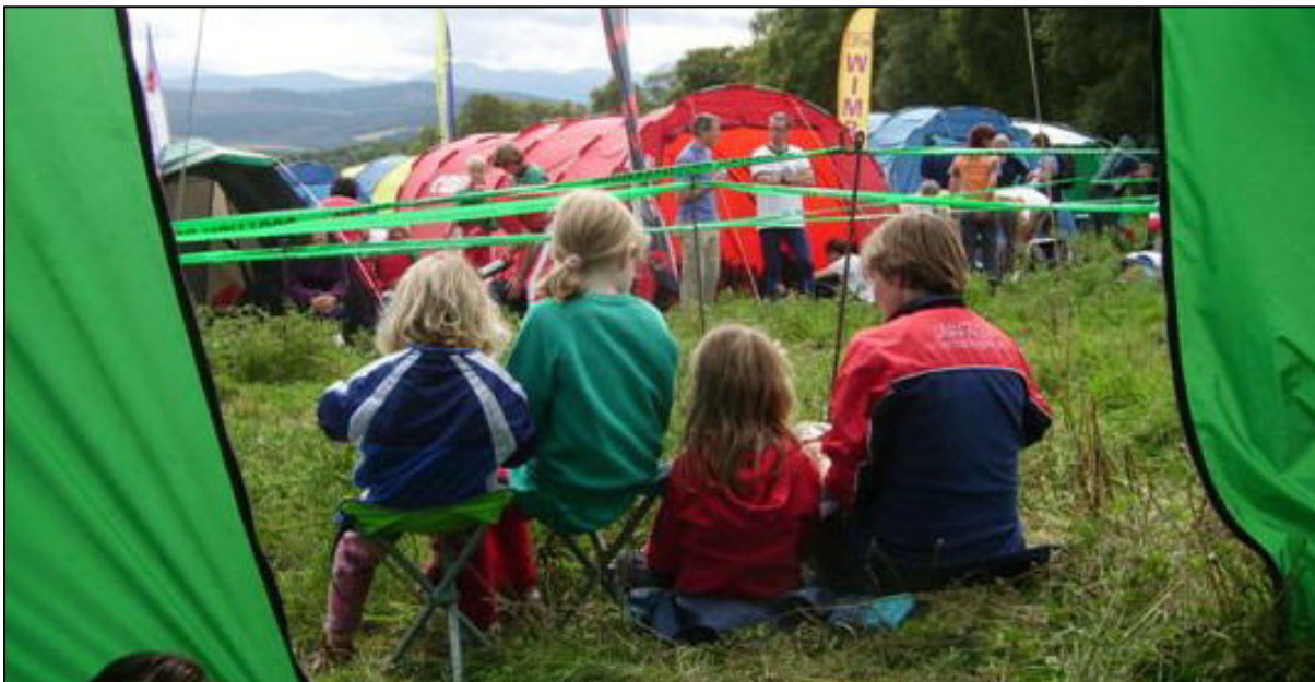
The future SOS committee discussing the 2025 Development Plan

PS It looks good on your uni application!