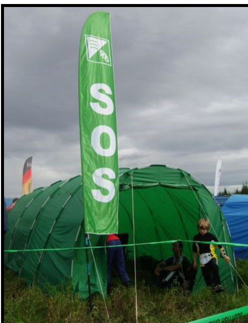
The club tent preparing to sail to Blidworth

There will also be White and Yellow EOD non-trophy courses.